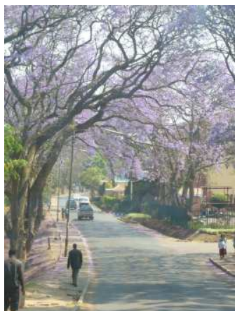
Jacaranda trees on a main street in Blantyre