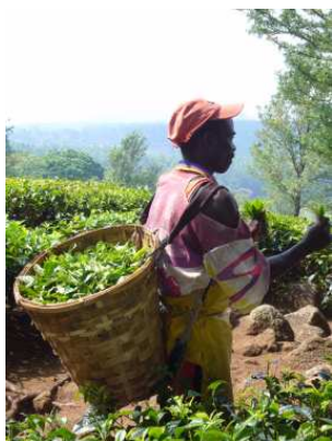
Malawi's main exports are agricultural: tea, coffee, sugar and tobacco