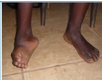
Deformities caused by poorly administered injection of malarial treatment. A tragically avoidable reason for surgery

Sadly, as we do more and more operating at CURE, we are noticing: