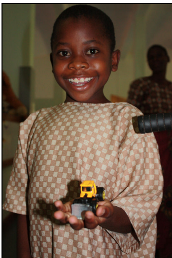
A small donated matchbox toy is almost certainly the most expensive Christmas present this young patient has ever had