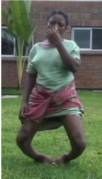
Not just straightening legs, but helping straighten and heal a child's understanding about God's Love for them, is the most privileged part of being in Malawi